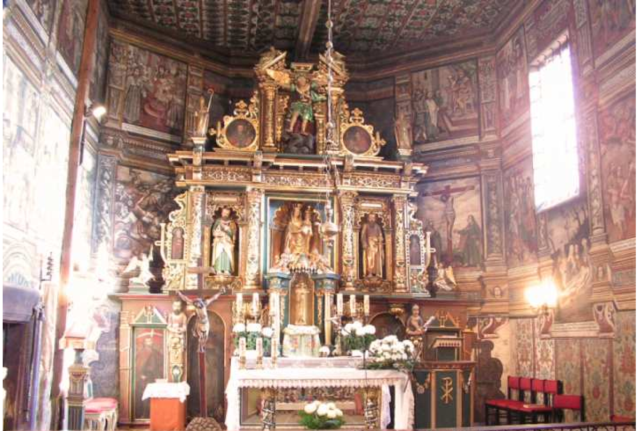
ST MICHAEL ARCHANGEL CHURCH IN BINAROWA